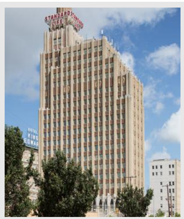
Standard Life Building