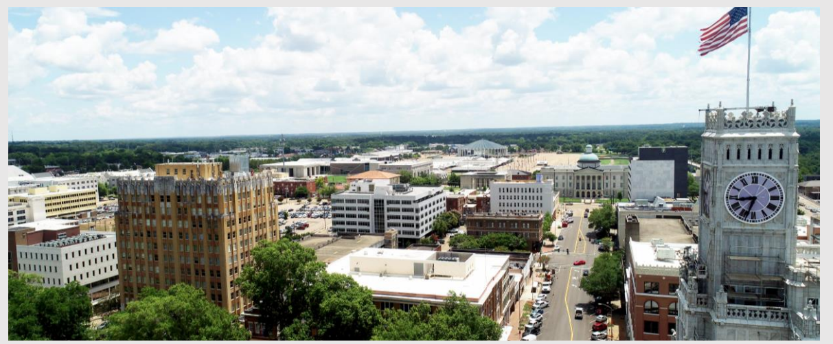
Downtown Jackson