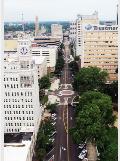
Downtown Jackson

The Executive Director is responsible for supervising (hiring, evaluating, and discharging, when necessary) all personnel assigned to the JRA and managing services provided to JRA by third party contractors, including developers, facility operators, appraisers, real estate professionals, surveyors, attorneys, planners, engineers, architects, and others. She or he reports to and receives policy direction from the JRA Board of Commissioners.